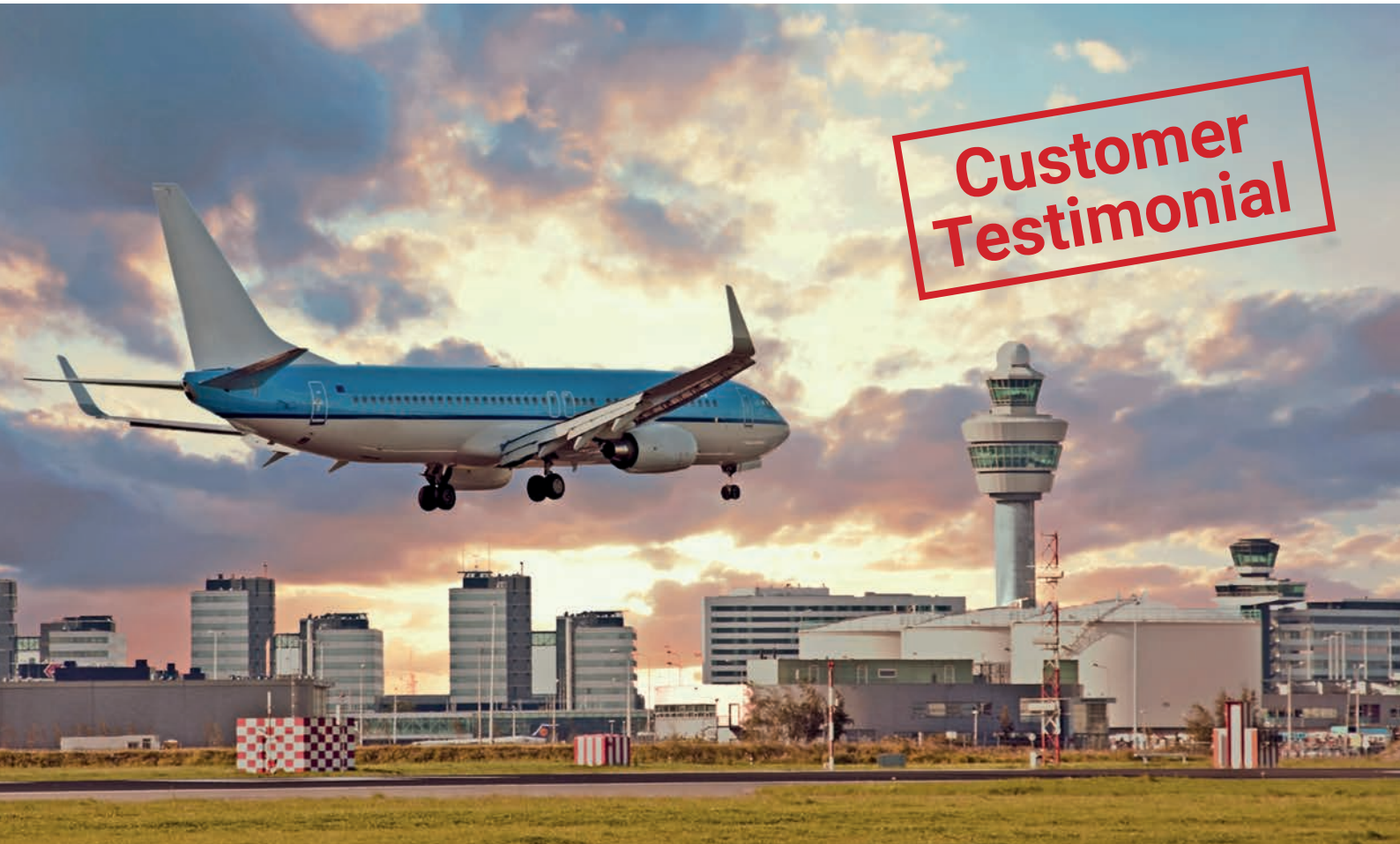
Amsterdam Airport Schiphol